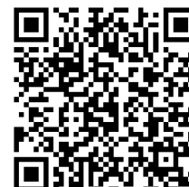
Digital Technical Specification 2024-02-09