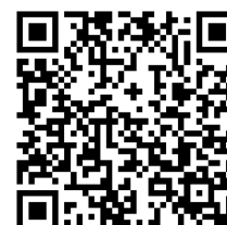
Цифровая техкарта 2026-02-20